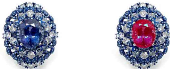
3130 COLOR CHANGED